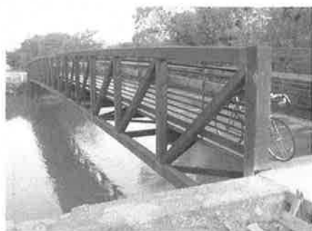
In late fall 2006, the newly erected IPP Des Plaines River bridge at the far east end of the Main Stem was already receiving traffic from trail users.