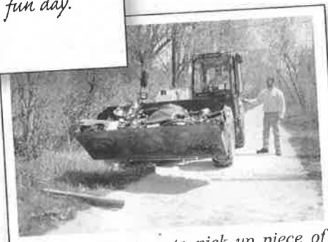
Village crew stops to pick up piece of lumber. Note scaffold in bucket.