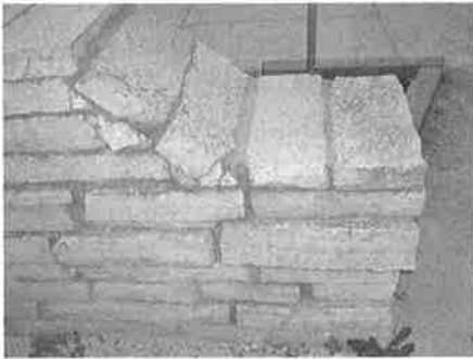
Tuckpointing repairs were necessary to the decorative stonework at Volunteer Park in Wheaton