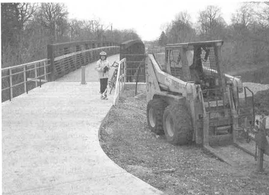
A freshly poured concrete ramp greets trail users on the western side of the new Des Plaines River bridge.